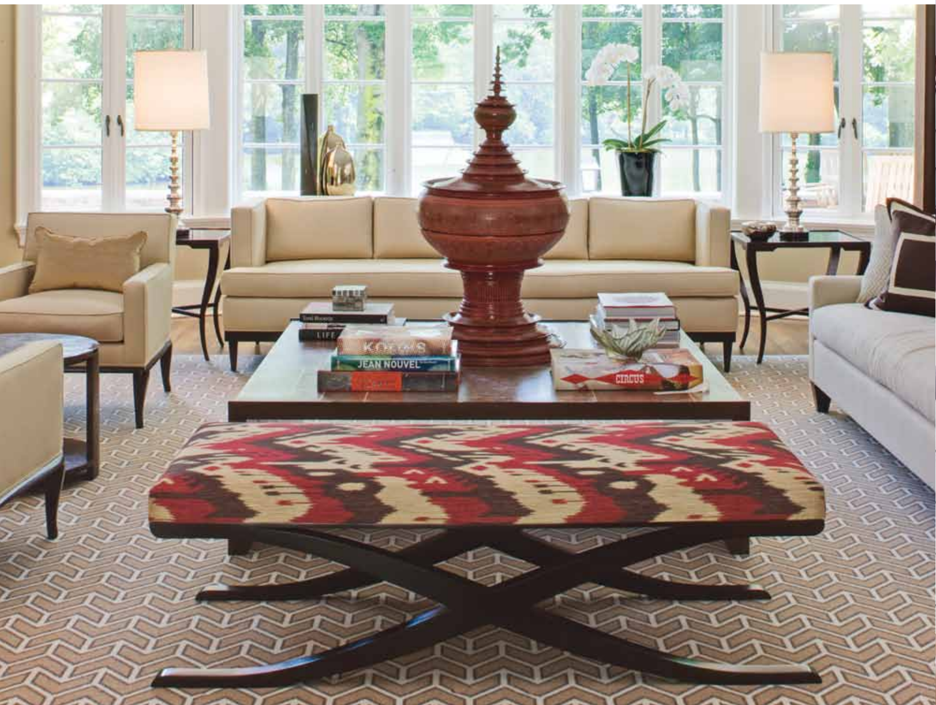
An Elegant Mix | An Edward Wormley-style sofa and custom chairs done in Hinson twill, lend an air of elegance to the living room (ABOVE). The chevron-patterned carpet is by David Hicks for Stark; the Ikat on the cross-legged bench is by Kravet. Nice And Easy | The neutral palette, with a hint of blue, continues into the family room (OPPOSITE). The sofas and console are custom Tocar; the club chairs are from Roman Thomas, the drum shade is Boyd Lighting. See Resources.

Where the family room is all about casual comfort, the living room is sheer sophistication in creams and chocolate browns, with lots of center seating. The sculptural antique Asian urn, collected by the couple on their travels, presides on a walnut-and-mica low table and influences some of the burnt-red accents; other beloved antiques are incorporated into the room. The bench is upholstered in a crimson Ikat that plays off the chevron carpet.