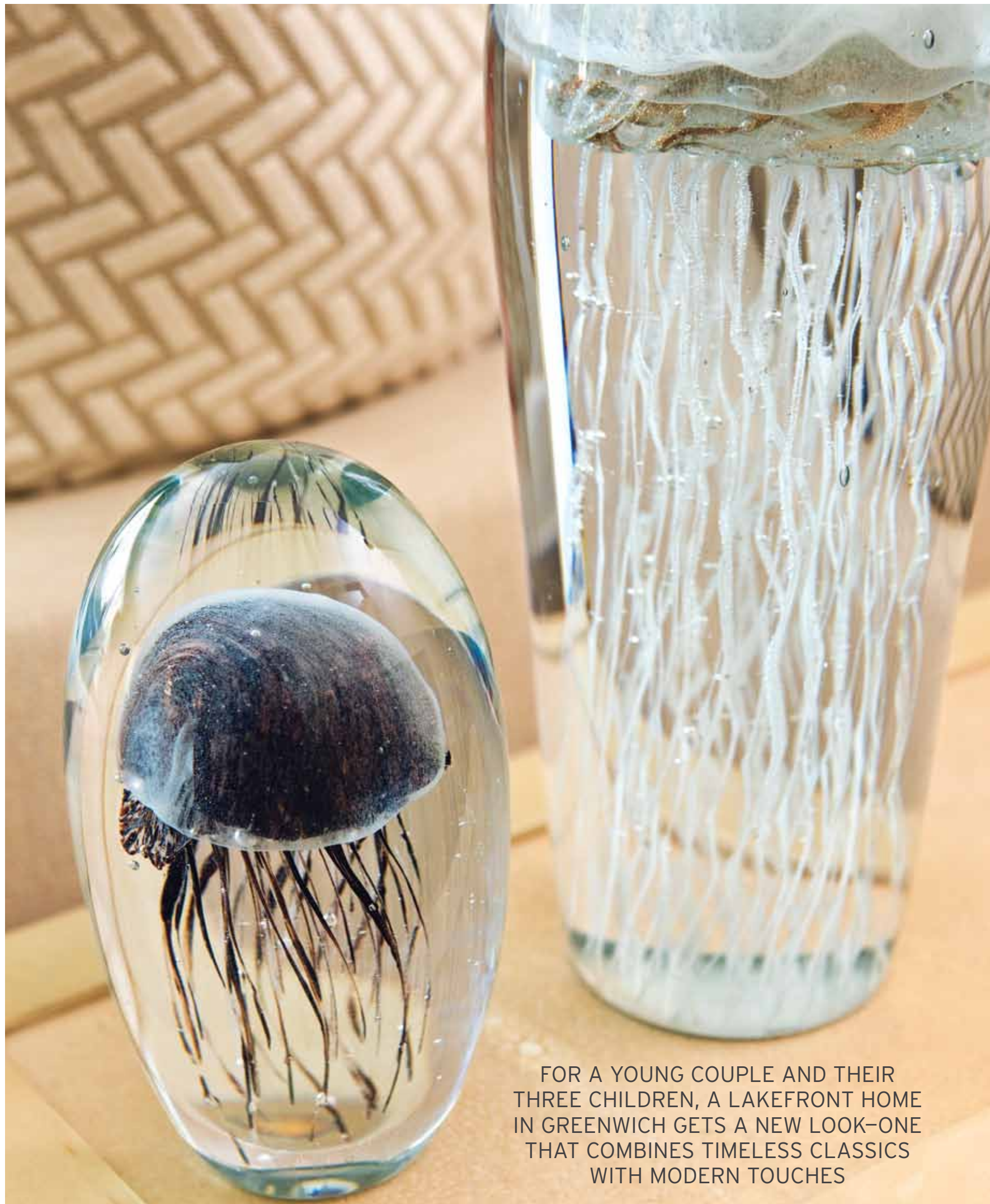
FOR A YOUNG COUPLE AND THEIR THREE CHILDREN, A LAKEFRONT HOME IN GREENWICH GETS A NEW LOOK—ONE THAT COMBINES TIMELESS CLASSICS WITH MODERN TOUCHES